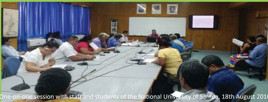
One-on-one session with staff and students of the National University of Samoa, 18th August 2016

The Ministry acknowledges the institution's initiative to involve Government Ministries in their programmes as it provides the students with the reality of how they are studying will be applied in the real world of that will contribute to the development of the economy. Further the Ministry was fortunate to receive great feedback from the staff and students on other areas that can be looked at for further developments.