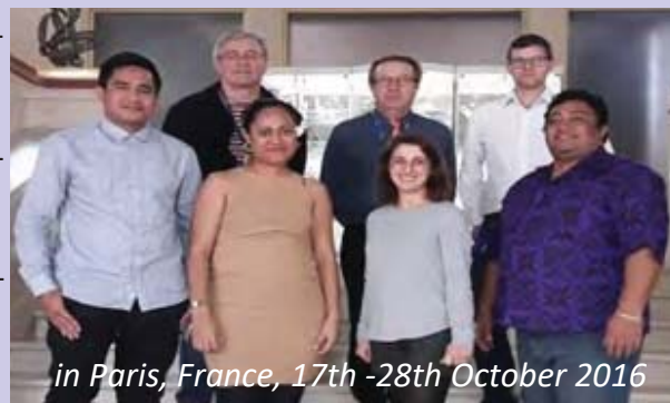
in Paris, France, 17th -28th October 2016

The overall training program was very beneficial as it practically relates to the line of work especially with inspection of trader's scales, calibration of petrol pumps and testing of numerous weights and measures.. It was noted that Samoa needs to put more effort on development of metrology in order to meet international standards.