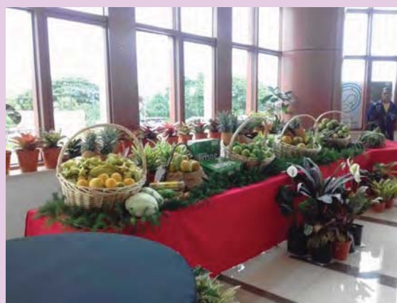
Showcasing of local produce

To conclude, the main purpose behind the Agritourism policy setting forum was to exchange ideas and concerns amongst the participants from both the public and private sectors in order to come up with some suggestions or recommendations to develop a policy in the near future, which would strengthen linkages between our agriculture and tourism. This would hopefully, lessen the need of imported produce for consumption in our tourism sector and increase the consumption of our local produce that would also lead to the result of our local farmers and their farms and local suppliers to be developed more and attract more tourists to consume locally made food and products.