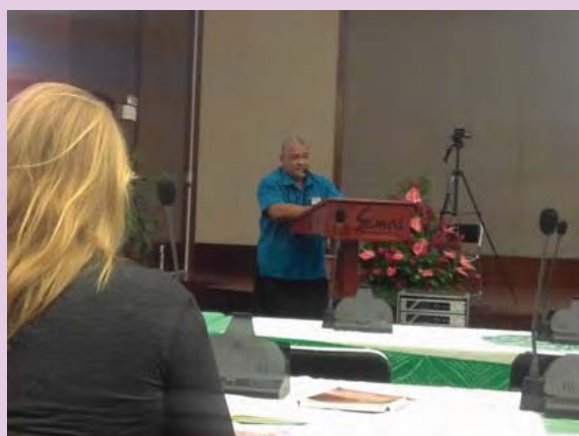
ACEO of RCIP during his presentation day 1

The main concern stressed by various panellists was the need to promote local produce and use of local farmers to supply local fruits and vegetables to the tourism industries instead of relying on the imported ones, but also working on improving the standards of local produce and food preparation standards. We also had a private business owner of Misiluki Beauty Products, presented on her journey on bringing Misiluki Skin-care concept to life, which is inspiration to other Samoans who are also looking to set up their businesses. This was one of the examples of how our own local people have created skincare products using some local resources to promote "Samoan made products" to the world which is one of the important areas of Tourism that needed to be improved.