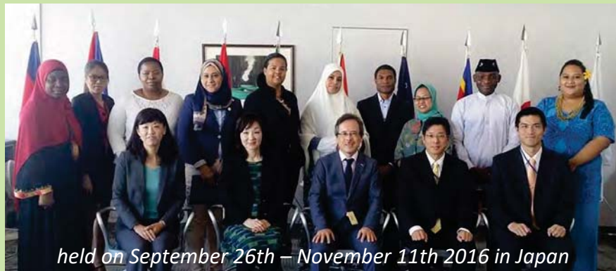
held on September 26th – November 11th 2016 in Japan

In summary of the educational training that was conducted, the knowledge and skills that I have gained helped broadened my capacity and that I can now be able to understand more and be practical when dealing with these issues internally and outside of the working area.