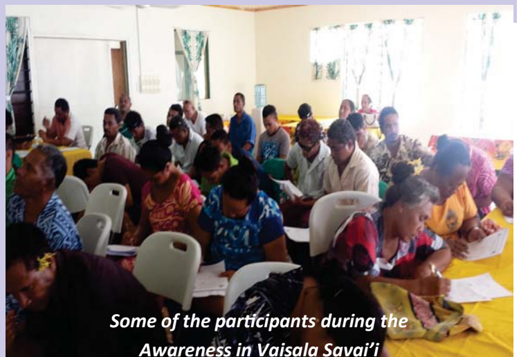
Some of the participants during the Awareness in Vaisala Savai'i

The employment section of AELM division conducted an Industry Awareness Program on Thursday, 12th November 2015 as part of their on-going core plan activities at Vaisala Savai'i. The program focused on raising awareness for young people including school leavers concerning jobs that are available in the labour market. This was a good chance for the unemployed youth members to explore various opportunities that would assist them in creating job application skills. The program also benefited the participants as they were able to learn the procedure and work conditions that are required from different careers in the industry. It also inspired young people to explore and select for their possible future careers. Consequently and more importantly this event was very successful as the target group were able to understand and share presentations arranged and delivered after thorough discussions on questions raised on various issues.