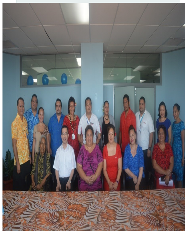
Samoa National Tripartite Forum