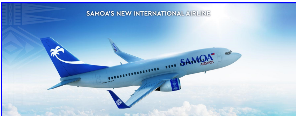
Samoa Airways - Samoa's new international airline