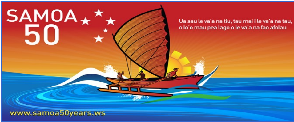
Independence golden jubilee—2012