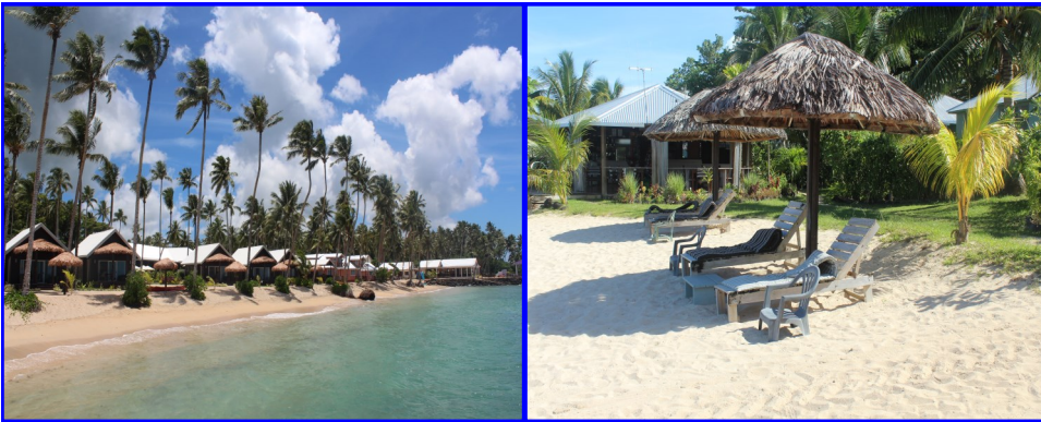
A few of the accommodation sites available